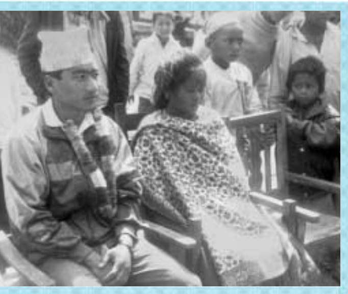
A young couple at their wedding in Nepal. Where early marriage is common, women often become pregnant during adolescence. Encouraging later marriage and delayed childbearing can help reduce the incidence of adolescent pregnancies and their risks.

Other women living with untreated fistulas, however, show remarkable resilience and strength. Despite the stigma, they find ways to support themselves and their children, and some set aside money for years for fistula repair (18).