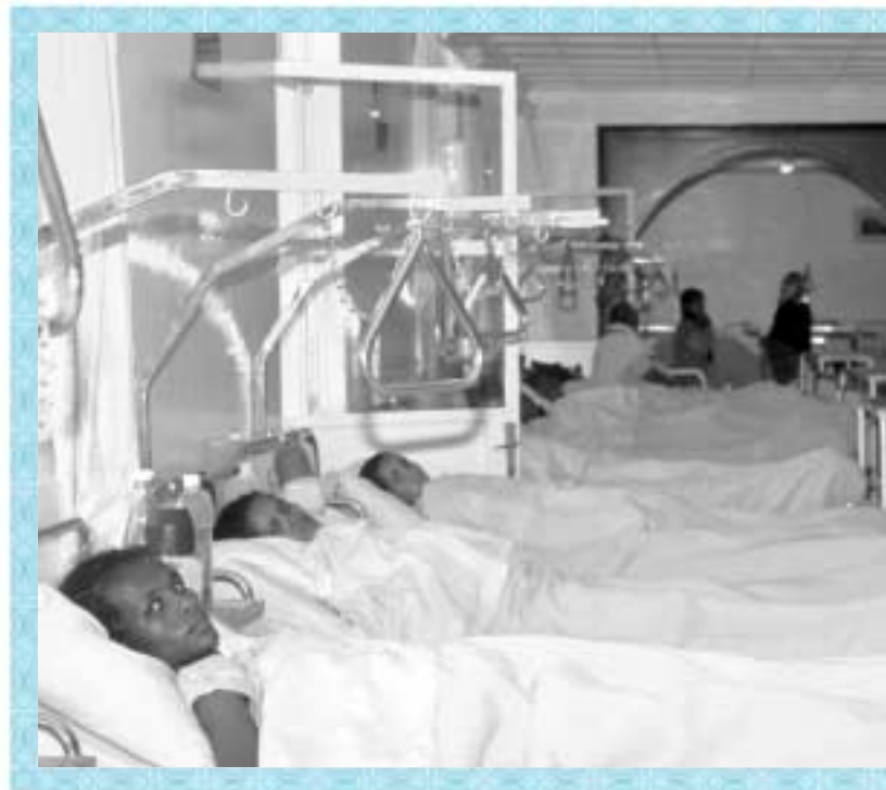
The Addis Ababa Fistula Hospital offers free treatment, housing, and counseling to all patients. Recovery after surgery generally takes two weeks.

Offering more schooling and family life education for women also can help reduce obstetric fistulas (71). In particular, expanding health education and family planning programs will provide more women with information and services to delay childbearing until they are ready. Schooling helps young women raise their economic and social status and promotes maternal health (21).